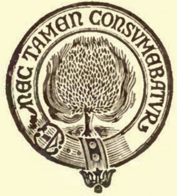
Presbyterian Church of Canada Crest in 1919

As the hart panteth after the water-brooks, O God, our souls do thirst after thee, that we may see thy power and thy glory, as we have seen them in the Sanctuary, and be satisfied with the goodness of thy House. Lead us and guide us unto thy holy hill, and bring us together with sweet converse to the place of prayer, to hear thy Word of Truth in the spirit, to offer the sacrifices of joy with thy people, and to make melody in our hearts with the songs of Zion. Prepare us, we beseech thee, for a true entrance into the secret of thy tabernacle, and bless thy churches everywhere this day with the clear shining of thy Presence; that the Holy Spirit may descend on many hearts, and multitudes may be brought from the kingdom of Satan into the Kingdom of thy dear Son Jesus Christ. Amen.