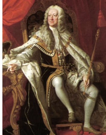
King George II

The foreman swore he would be as mad as George Whitefield, if he kept thinking like that. "What have you done," he said, "that you need to make so much ado about salvation? I always took you to be as